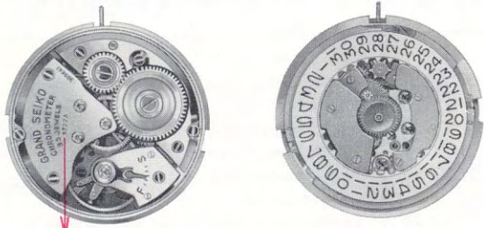
Cal. 5722A ( or 430 )